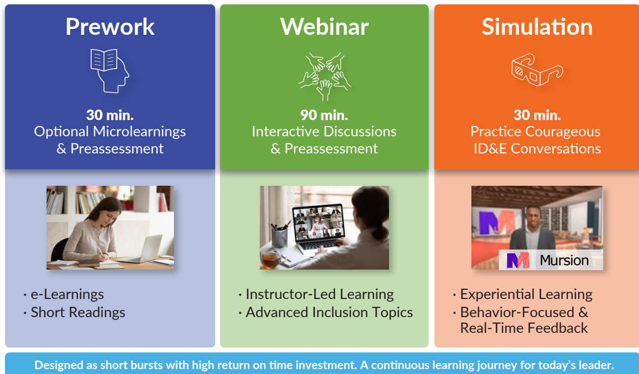
Figure 1: Dow's Inclusive Leadership Program Elements